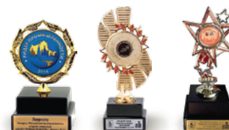
Multiple winner of the contest "Leader" Industry of Moscow »2014 - 2017 years