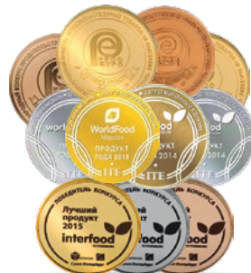
11 medals Product of the Year