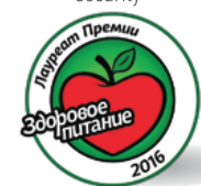
Award "Healthy Nutrition"