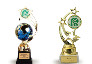
2 Grand Prix "Best Innovative product" at the exhibitions Prodexpo 2015 and 2016